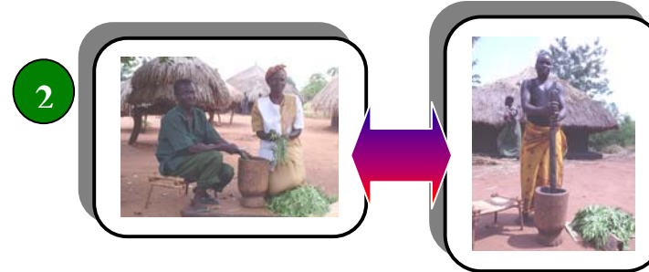
2 • Sort 1kg each of the leaves & pound them together