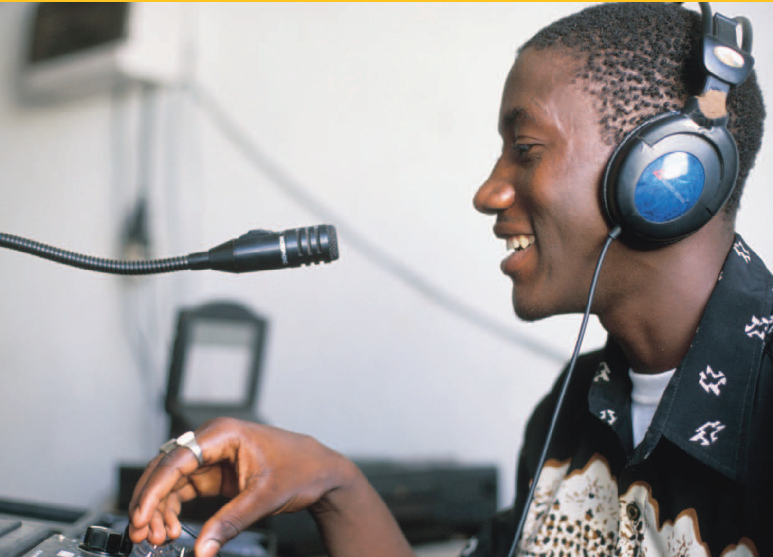
Guinea Bissau DJ at a local radio station, presenting a programme about HIV and AIDS.