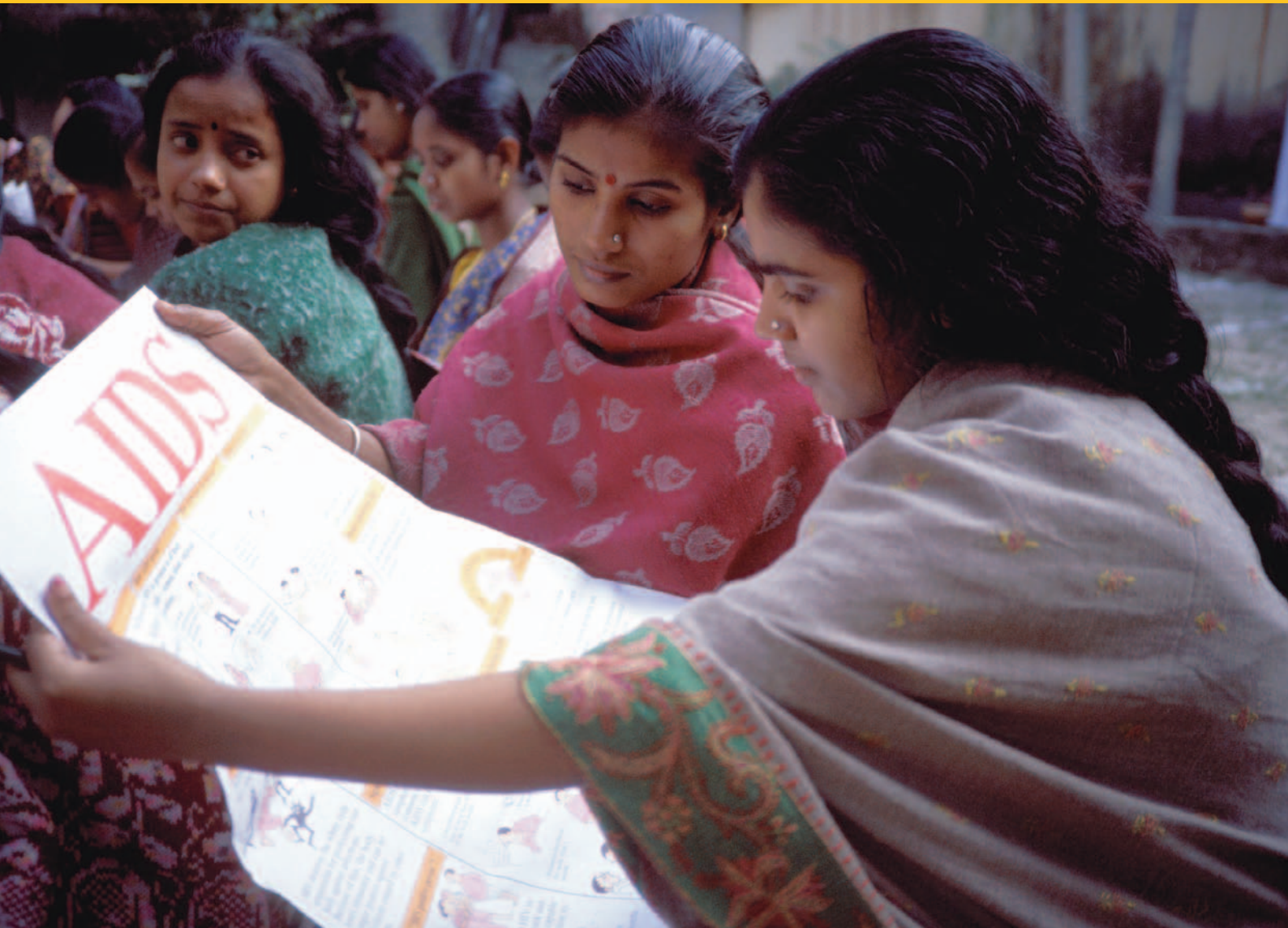
India Calcutta AIDS education for community health volunteers.