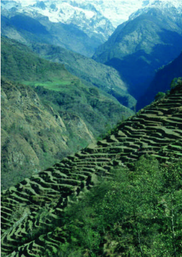
Figure 3.1: Terrace systems below Annapurna – an enduring feature of the Himalayan mid hills of Nepal.