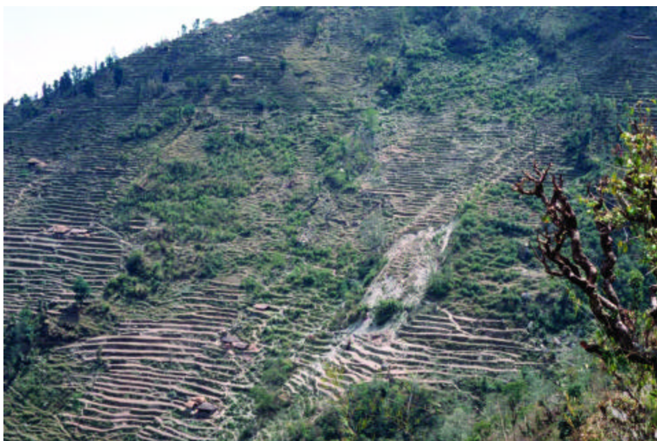
Figure 3.4: Landslides cut through old terrace systems near Landruk, mid-hills of Nepal

This gives rise to vulnerability to catastrophic events, such as landslides, hailstorms, and loss of infrastructural assets. Fragility is related to sensitivity and resilience, and in both aspects, hillsides are exceptionally vulnerable. They are sensitive in the sense that only small ‘shocks’ or perturbations may have an exceptionally large effect, such as landslides or rockfalls. They lack resilience in the sense that these same shocks are far more common in their occurrence and hillside slopes will usually always suffer some consequence. Hillside farmers in Nepal use local terms for ‘strength’ and ‘power’ of their soils, which encapsulate notions of degree of fragility (Joshi et al. 2004). Unpredictable and severe disruption to livelihoods is endemic in mountain communities, because of the steep slopes and sudden storms, often of hail, which cause great damage to crops, houses, livestock, and communications. Landslides are an especial problem in hilly areas of south and Southeast Asia where terrace systems predominate – see Figure 3.4.