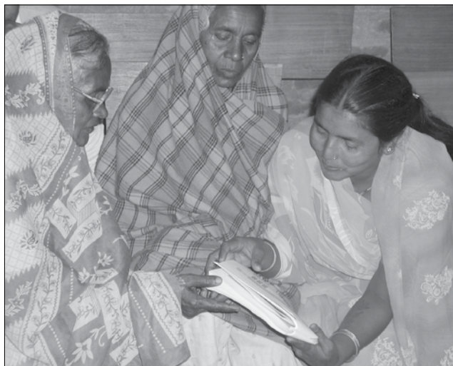
Community health volunteers in Nepal test materials developed for the distance education Radio Health Programme.

James Johnson argues that developed countries need to become self sufficient in meeting their own health workforce requirements, but the biggest English speaking health care labour market – the USA – will have to be involved in any initiative if