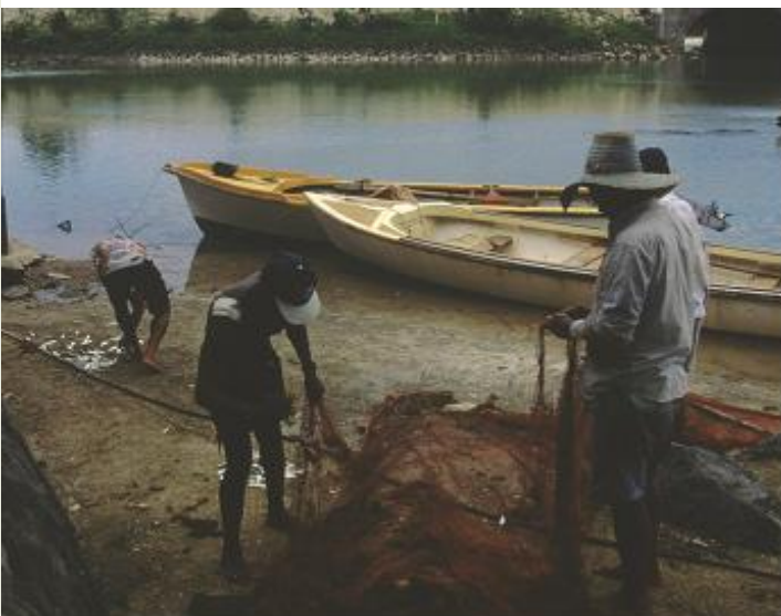
Photo: Small scale fisheries represent a vital resource for small island states.

As well as the human aspects of the fishery, effective decision making structures require knowledge about the biological nature of the fishery. Uncertainties around the state of the stock, the stock dynamics and interaction with other sectors and components of the ecosystem in turn require tools to understand the fishery and trained assessment scientists who can advise the decision makers on the state of fisheries resources and the likely consequences of alternative management actions. Given the dynamic nature of fisheries and fluctuations in the stock this advice needs to be both accurate and timely.