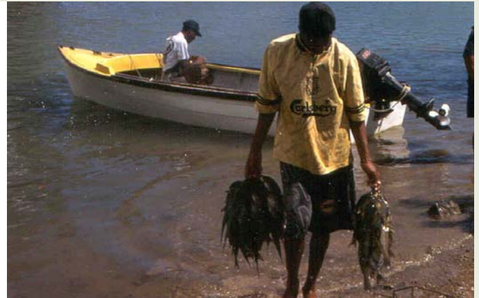
Photo: Small scale fishers in the Indian Ocean land their catch from the reef fishery

Unlike trees, which can be counted, fish are effectively invisible. Our knowledge about the size and distribution of the stock is therefore based on sampling and the use of statistical methods—the stock assessments—that often require skilled assessment scientists to work this out. Skills that can be in short supply in developing countries.