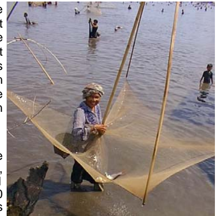
Photo: Woman participating in community fishing day. Dong Noi village, Lao PDR.

This research has contributed to international efforts to achieve the Millennium Development Goals (see below) by supporting fisheries managers and policy makers in the sustainable management and development of fisheries in developing countries.