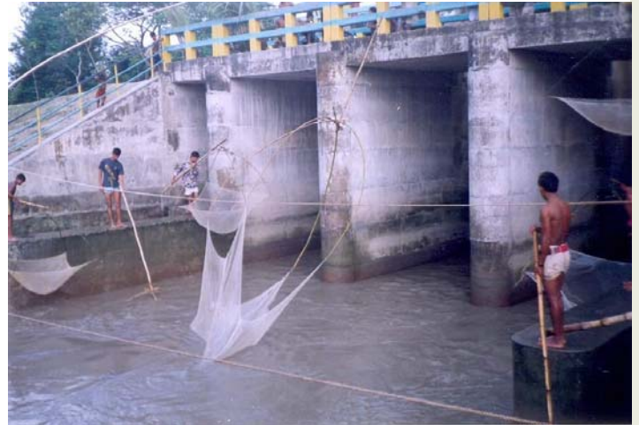
Photo: Fishers at an irrigation sluice gate, Bangladesh.

Management cannot always be conducted at the community level. Fish stocks are often widely dispersed and/or migratory. Where the boundary of the fish stock is greater than the community the fishery becomes a common pool resources and, as such, community management is not always appropriate. In turn this requires effective governance structures at a larger scale, often national. However, the role of fisheries in livelihoods is both complex and dynamic. There is therefore a need to develop and put in place structures that enable the voices of the fishers and others dependent on the fishery to be heard, and for management decisions to be implemented, monitored and evaluated effectively.