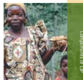
Compliments of CIP

The ultimate solution to eradicating undernutrition among the poor in developing countries is to diversify diets and substantially increase the consumption of nutrient-dense food such as meat, poultry, fish, fruits, legumes, and vegetables but it may take many decades for diversified diets to be affordable for the poor. Meanwhile, biofortification makes sense as part of an integrated food-systems approach to reducing undernutrition. It addresses the root causes of micronutrient malnutrition, targets the poorest people, uses built-in delivery mechanisms, is scientifically feasible and cost-effective, and complements other ongoing interventions to control micronutrient deficiencies. It is an essential first step in enabling rural households to improve family nutrition and health in a sustainable way.