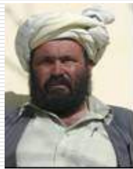
Malistan Community Facilitator