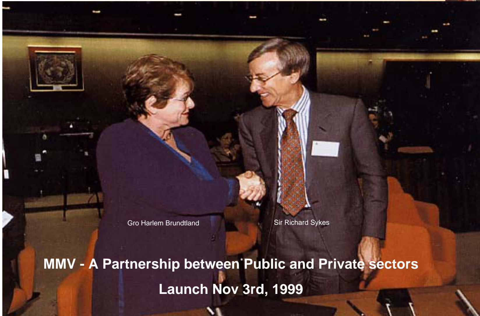
Gro Harlem Brundtland