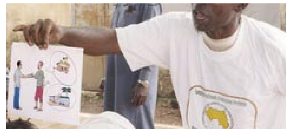
A field worker for the International Foundation for Election Systems explains to villagers in Bokariah, Guinea, how their tax money can be used to pay for community projects, like the construction of bridges or schools.

The degree of coercion that can be applied without damaging relations between states and citizens will vary according to local circumstances: the more fair a tax system is seen to be, the more it will be possible for tax authorities to take a firm stance in enforcing the law. The South African Revenue Authority, for example, has managed to increase overall tax while improving the service to taxpayers, helped by widespread support for redressing the inequalities of Apartheid, alongside special investigative measures to enforce compliance.