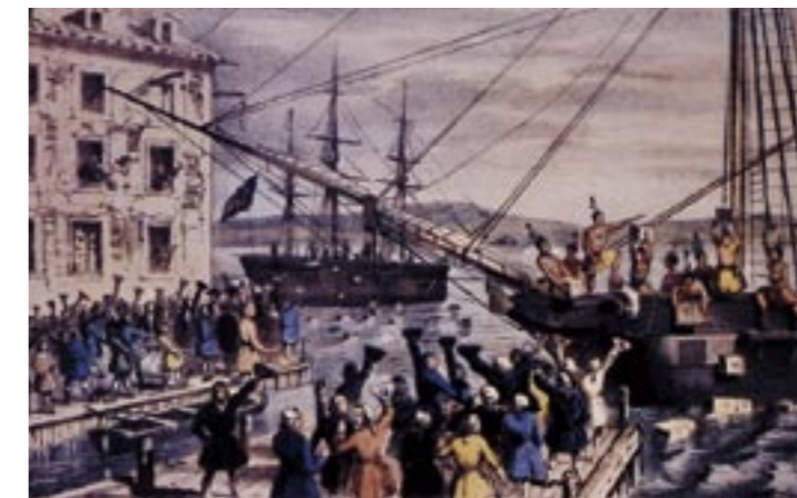
“No taxation without representation.” American colonists reject the tax on tea and colonial rule at the Boston Tea Party.

Governance refers to the processes through which states acquire and use their power and authority. Better governance comes from strengthening the responsiveness of states to the needs of their citizens; their accountability