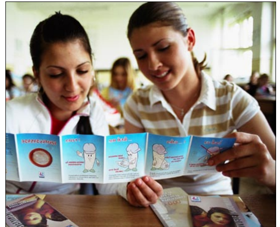
High school students in Bucharest, Romania, examine a condom advice leaflet and other contraceptive educational materials during a talk on sexual health.

Unsafe abortion carried out by individuals lacking the necessary skills and/or in unhygienic conditions, is a major global public health problem. The practice occurs where abortion is legally restricted, and where access to safe services is inadequate although the law may broadly permit the procedure. Unsafe abortion causes death and ill health in women, and