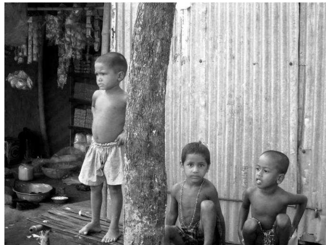
Young children in rural Bangladesh mind the shop while the adults are busy elsewhere. While work can be a learning experience for children, and helping out can foster their sense of self-esteem, it can also disrupt their formal learning and, depending on the nature of the work, endanger their health during a developmentally sensitive period.

MA Children, Youth and International Development, Brunel University. New for 2007. This course is intended to equip students with the conceptual understanding and breadth of empirical knowledge needed to critically evaluate policy and practice in the area of children, youth and development, and to provide the skills necessary to design and undertake research relating to children, youth and development. For further details, see www.brunel.ac.uk/courses/pg/cdata/c/Children%2c+Youth+and+International+Development+MA+(Approved+in+principle) .