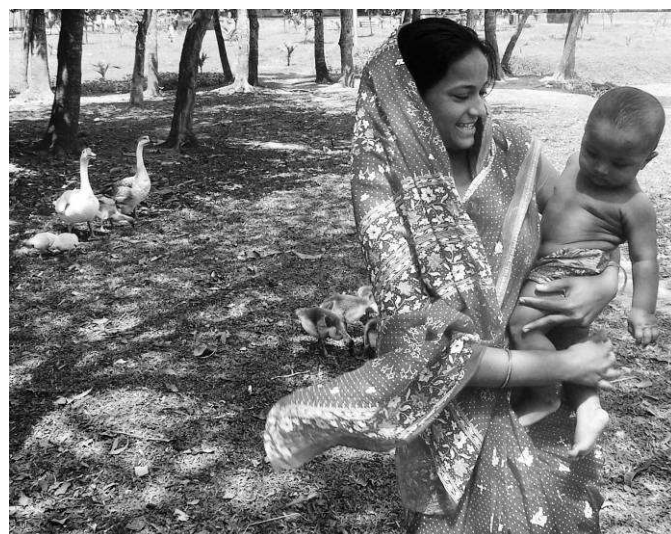
A young Bangladeshi mother and her child enjoy a sunny spring afternoon, in the company of her neighbour's geese and goslings. Having access to small and productive yet liquid assets such as these can help women cope with small shocks in order to keep their children nourished and in school.

In October 2006, CPRC held an internal workshop at the University of Manchester at which experts from a range of disciplines shared concepts and methods that can be useful for analysing poverty dynamics and chronic poverty. The papers on which the preceding note is based were first presented at this workshop. See www.chronicpoverty.org/news_events/ConceptsWorkshop-Oct2006.htm for other papers.