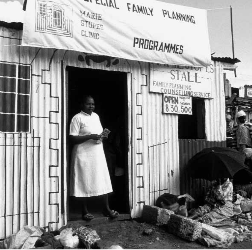
Poorer people may lack money for transport so it makes sense to situate sexual and reproductive health services within the community.