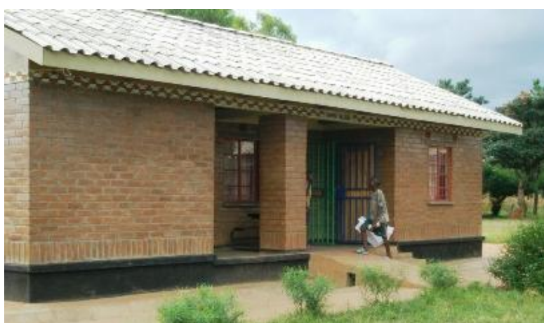
Figure 6: School Head's office and staff room at Pamoza Primary

According to the PEA and the school head, overall attendance has improved over recent years. They attribute this to mobilisation campaigns of NGOs and the new buildings, which attract pupils. The SMC noted that some villagers still do not do enough to ensure their children go to school, however, and all key informants agreed that absenteeism is high during the hunger period of January to March. Absenteeism is also high during weekly markets. As many as a fifth of all pupils enrolled in senior classes are repeating the year. Whilst the proportion of boys and girls dropping out from senior classes is similar, the poor gender parity ratio in favour of boys shows an overall lower enrolment of girls, with girls making up only 80% of pupils in senior classes. Key informants agreed that those that do drop out permanently are mainly over age pupils, girls, and orphans.