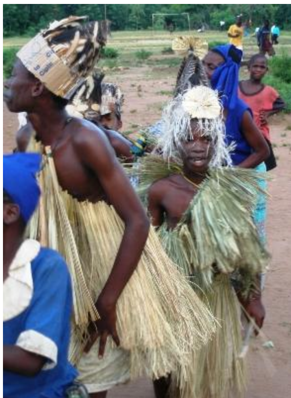
Figure 4: School pupils practicing traditional dances at Namalongo Primary

Whilst in the past education was not seen necessary for farming activities, community members note a change in attitudes in recent years. The GVH also observed that greater opportunities for access to secondary education and employment in the area have increased interest in education. Apart from one minor land disagreement, key informants agree that there is a good relationship between the school and the community, with community members supporting the development efforts of the school. The school provides a meeting place for many community-based activities, including sports activities, traditional dances and other youth activities.