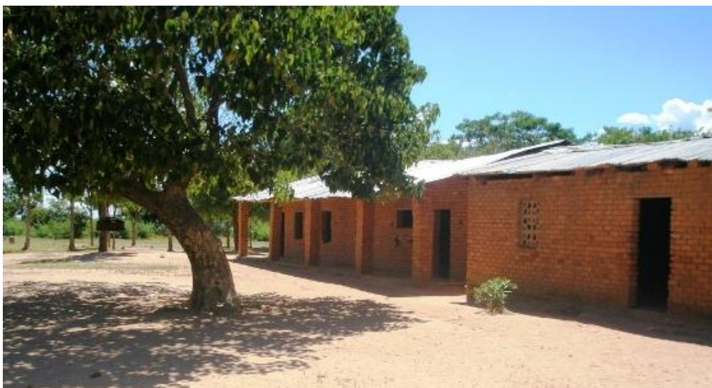
Figure 5: Kamunda Primary, showing community-built classrooms