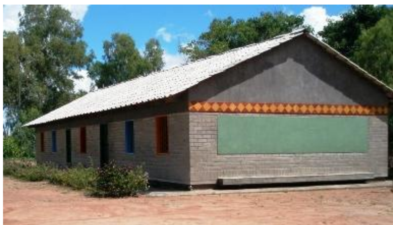
Figure 3: A newly constructed classroom block at Duma Primary

The school buildings consist of three brightly-decorated classroom blocks and an office block recently built under a DFID-funded construction programme and several older blocks in poorer condition. Blocks of well-constructed toilets and hand washing facilities were also provided under the same programme, although the latter do not function as the school borehole is broken and there is no other water source at the school. The area in which school is situated has a high water table of brackish water and access to clean water is a big concern for local inhabitants. Malaria and bilharzia are common illnesses amongst pupils.