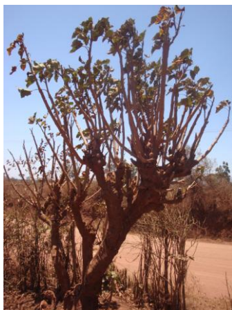
Fig. 6 Natural growing Jatropha curcas tree in Nyanza Province, Kenya

Though Jatropha is not indigenous to Kenya, the species seems to have been introduced close to a century ago, judging from the age of the trees growing wild in the country. The history of its introduction however is not well known. From the natural stands in Kenya, the tendency to spread has not been observed and it is rare to find young trees. This by no means should be taken as a proof that it is not invasive but could give indications that the problem may not be to the scale reported such as in Australia. Long term observation, especially and large scale planting should be undertaken. The debate must not be held purely in the scientific community or the developed world. It must involve the poor rural communities in the developing world where many of these biofuel crops will be grown. Their needs for improved living standards must be addressed and their involvement sought in achieving the best balance between revenue generation and long term sustainability.