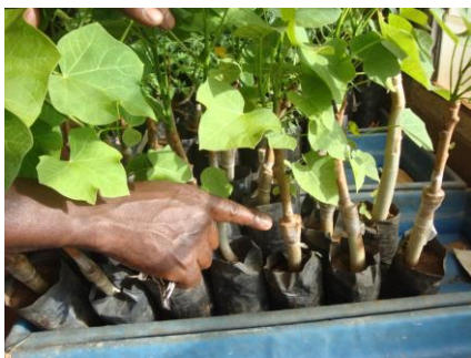
Fig. 5 Improvement trials of Jatropha curcas in Kenya

1.Crop development / germplasm improvement: development of early maturing varieties (early fruiting jatropha), day neutral varieties –less sensitive to seasonal changes, high yielding seed / oil cultivars, high quality oil and other by products and site specific cultivars/ provenances