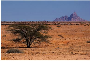
Fig.1 Degraded land in arid and semi arid areas of Kenya