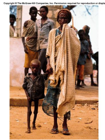
Fig.2 Famine in northern Kenya