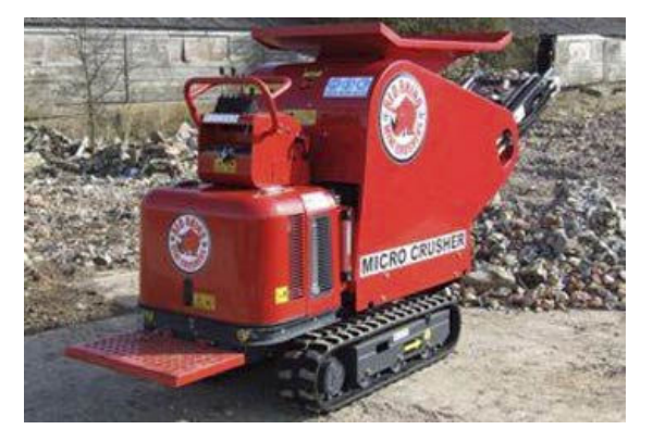
What mobile crushers are available in the region?

There are many models of mobile crushers available in the region. The two main manufacturers are Hoa Phat (Vietnam) and Shibang (China). The table below shows further details on the models of these crushers.