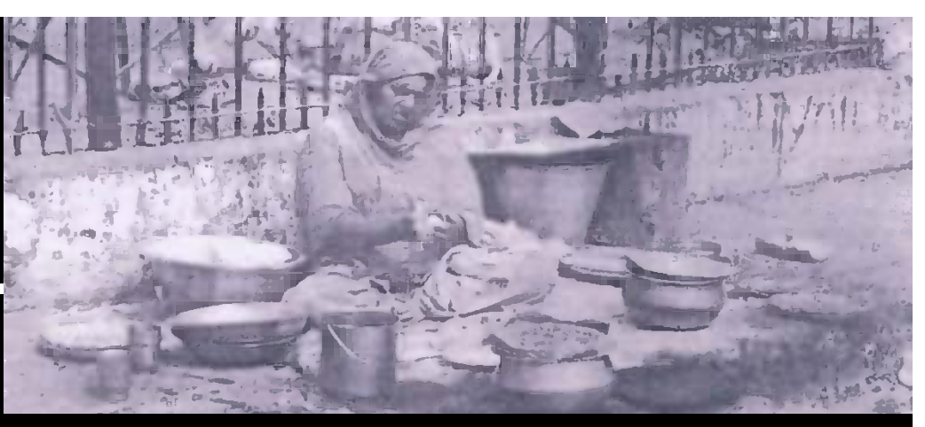
1951: economic rights: exclusion from Inheritance & Property rights

1935 –1937 Muslim Personal (Shariat) Application Act Gives women right to inherit property, never implemented