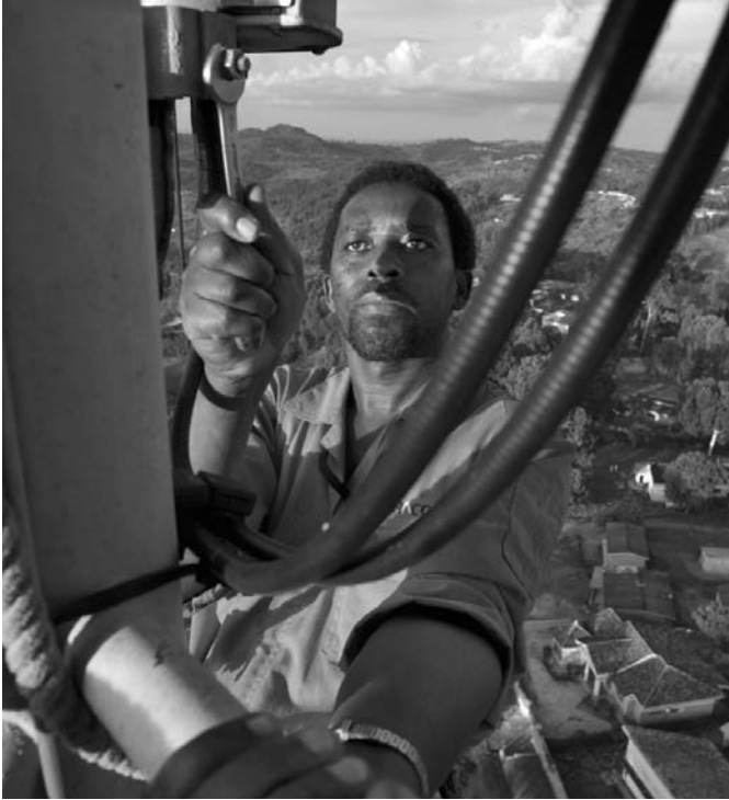
An employee of Terracom, a telecommunications firm, working on a transmitter/receiver for mobile phone communications in a rural area of Rwanda.