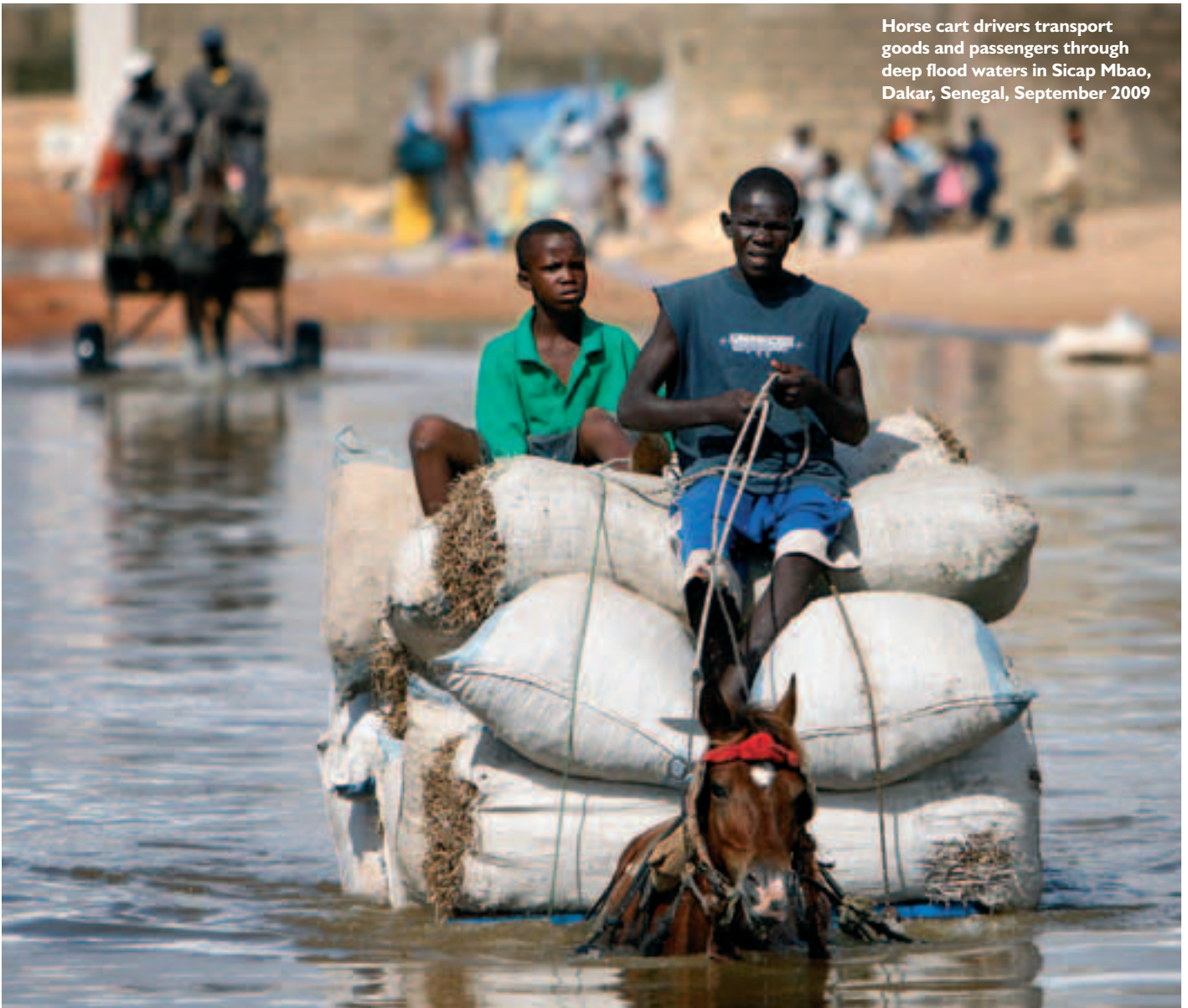
Horse cart drivers transport goods and passengers through deep flood waters in Sicap Mbao, Dakar, Senegal, September 2009

1 Earthscan/International Institute for Environment and Development (IIED) (1985), Lloyd Timberlake, Africa in Crisis: the causes, the cures of environmental bankruptcy