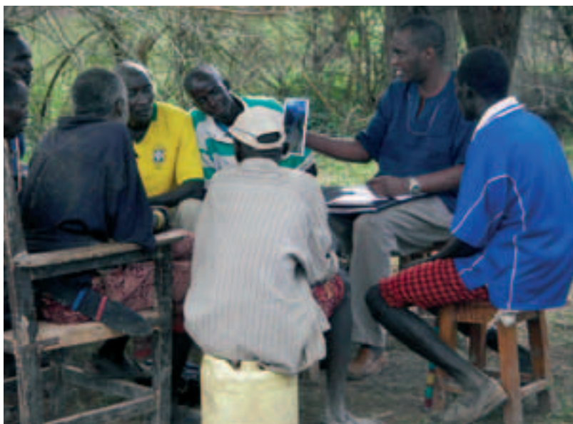
SAM OTIENO / BBC WST

“A lot of problems happened due to that deforestation. For example, there was rain before, but now after the deforestation, the rain became scarce. Then drought happened.” Male agro-pastoralist, Oromia, southern Ethiopia