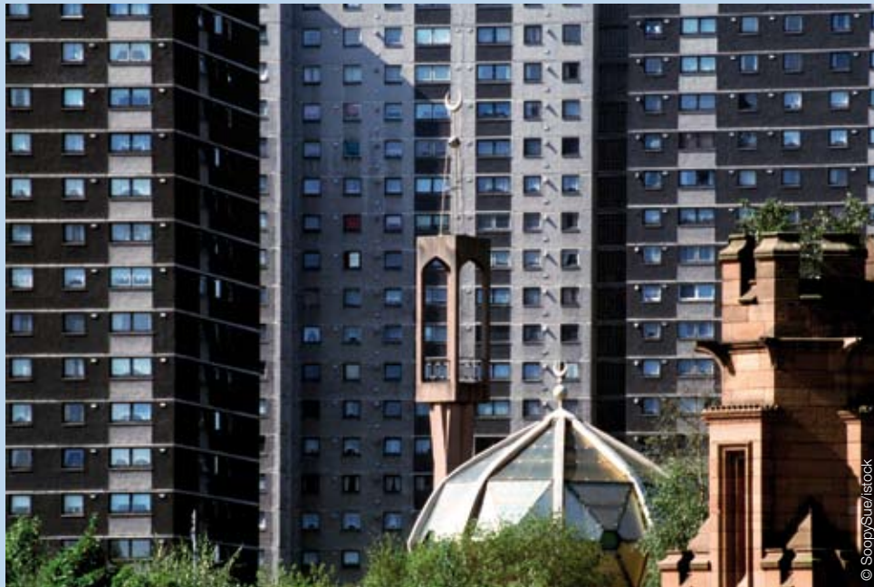
The dome and minaret of Glasgow Mosque and Islamic Centre contrast with skyscrapers of the Gorbals area of Glasgow.