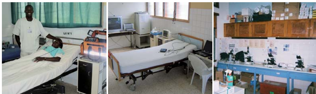
▲ Equipment supplied to the MRU at the Albert Schweitzer Hospital, Gabon, included beds; diagnostic and therapeutic bedside-equipment; computer-assisted monitoring of cardiac function, respiratory rate, blood oxygenation and body temperature; technology for resuscitation; and laboratory equipment.