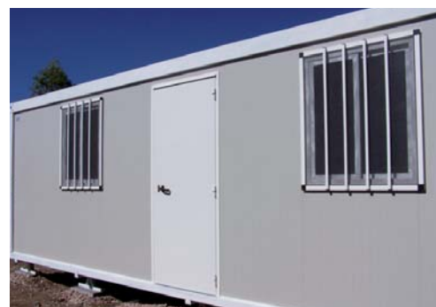
▲ A new pre-fabricated pod was constructed for use as a laboratory in Chokwe, Mozambique.