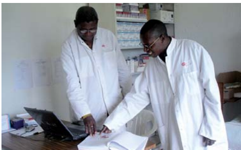
▲ Training in progress in Lambaréné, Gabon.

MMV works closely with the Swiss Tropical Institute and the Malaria Clinical Trials Alliance. These organizations provide training and technical assistance as well as infrastructural help to malaria research centres, such as those developed by MMV. We are also proud to support the African Network of Drugs and Diagnostics Innovation, started recently by WHO/TDR 2 and is dedicated to improving Africa's capacity to produce new medicines and diagnostics. Working closely with other groups who build capacity is an essential part of our mission.