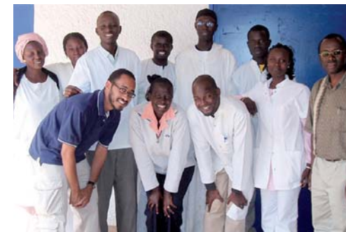
▲ The Pyramax® clinical development team, Dakar, Senegal.

The clinical trial sites initially encountered by MMV can be categorized into three types: clinical research centres that are GCP-compliant; those that are not GCP-compliant; and those with basic facilities that have little or no research capacity.