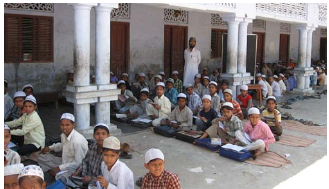
Madrasa in Sitapur, India

Ripples from the larger international controversy regarding madrasas' alleged association with terrorism have given a new twist to state-madrasa relationships in India. Given this and Muslim opposition to government interference, both the state and madrasas are wary of open confrontation and the former is proceeding cautiously with the modernization process. Although many argue that Muslim doubts are about the nature and extent of modernization and who leads it, rather than modernization per se, the madrasas do not speak with a common voice and are not organized to negotiate with the state for support on their own terms.