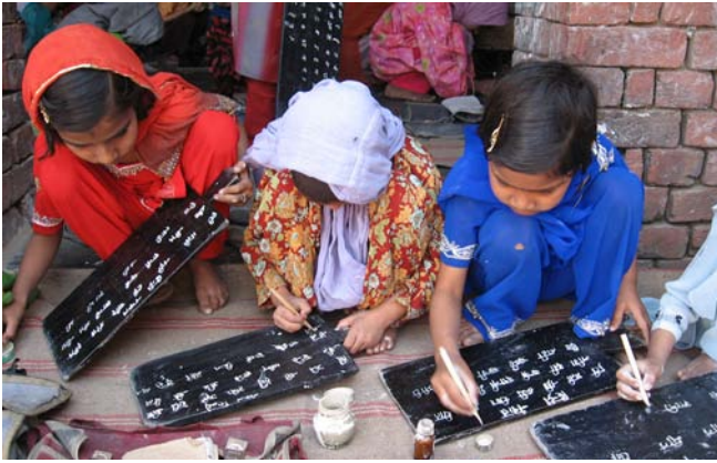
A girls' madrasa in Sitapur, India

north of the country, especially in the area later known as Uttar Pradesh. The aim was to preserve traditional Islamic learning by separating dini talim (religious education) from duniyavi talim (worldly education), but it led to a divide between religious and mainstream education, and to a view of the madrasa curriculum as rigid and unchanging.