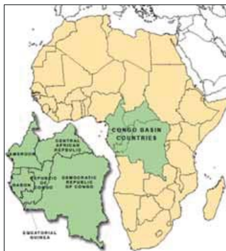
Figure 1. Map of Congo Basin countries (project countries are Cameroon, Central Africa Republic and Democratic Republic of Congo)

The project's main objective is to contribute to the development of policy-oriented adaptation strategies that also ensure the sustainable use of forest resources. This is to be done in the following ways: