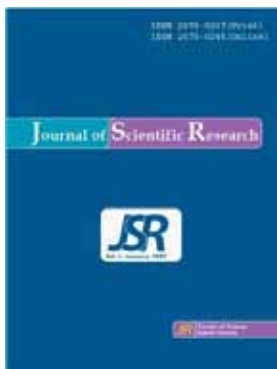
Journal of Scientific Research Vol. 1:1 2009

The Journal of Scientific Research (JSR) was designed to bridge a gap as the first international, interdisciplinary journal to operate from Bangladesh. Through Bangladesh Journals Online (BanglaJOL) and the Open Journal System (OJS), JSR has seen substantial growth in international submissions and reviewers since its launch - resulting in and increase from one issue annually to three.