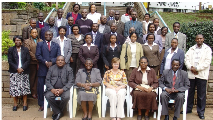
KLISC stakeholders meeting, 2008

Although organisations in all of our partner countries face different challenges, we hope that the ongoing success story in Kenya will inspire, and perhaps help, the formation of consortia elsewhere.