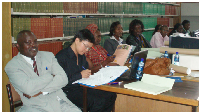
A KLISC-run Monitoring and Evaluating Electronic Resource Use (MEERU) workshop. A future facilitator of MEERU Vietnam was also invited to attend.

Despite the achievements of the Kenyan consortium, the road to its success was not always a smooth one. Founding members had to overcome a host of problems, many of which will be familiar to other researchers and librarians interested in setting up consortia.