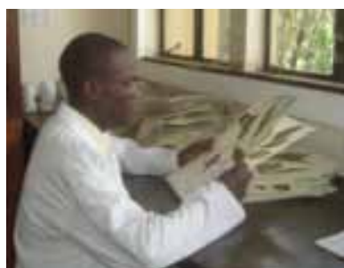
Developing of a botanical database, Tanzania

In its first two years, INASP's small grants scheme has grown to support well over one hundred training events in developing countries across the globe. Thanks to local leadership, the scheme has reached beyond the usual audiences and centres of excellence to raise awareness of – and foster expertise in – many areas of communication and publishing.