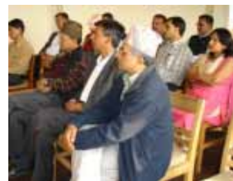
Strengthening Online Resources and NepJOL publications, Western Nepal

activity – in total, 135 events have been staged in a wide range of geographical and technical areas. INASP currently accepts applications for small grants twice yearly, with deadlines usually falling in January and July.