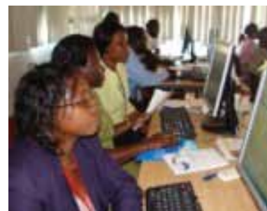
E-resources workshop, Uganda

A huge benefit of the small grants scheme has been to provide INASP with an invaluable and detailed snapshot of the training needs across our partner countries. This will help us to plan increased and better-