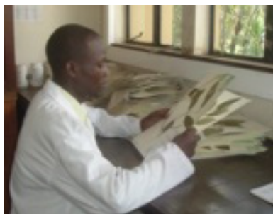
Developing of a botanical database, Tanzania

In its first two years, INASP's small grants scheme has grown to support well over one hundred training events in developing countries across the globe. Thanks to local leadership, the scheme has reached beyond the usual audiences and centres of excellence to raise awareness of – and foster expertise in – many areas of communication and publishing.