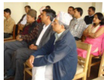
Strengthening Online Resources and NepJOL publications, Western Nepal

activity – in total, 135 events have been staged in a wide range of geographical and technical areas. INASP currently accepts applications for small grants twice yearly, with deadlines usually falling in January and July.