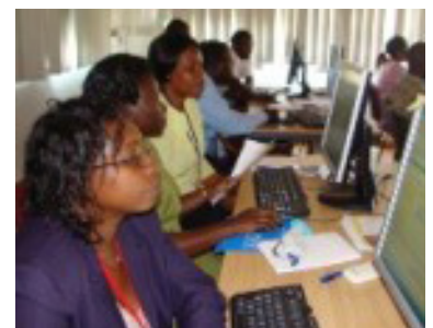
E-resources workshop, Uganda

A huge benefit of the small grants scheme has been to provide INASP with an invaluable and detailed snapshot of the training needs across our partner countries. This will help us to plan increased and better-