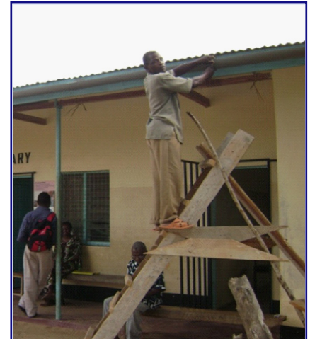
An example of DFF funded maintenance: fixing a gutter to collect rainwater