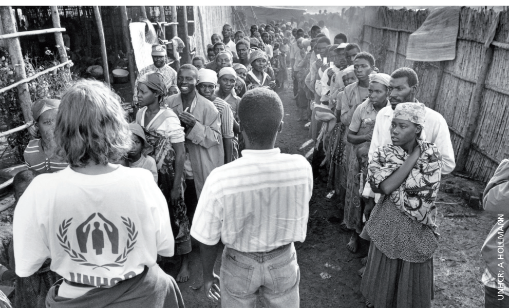
New Rwandese and Burundian arrivals from Cibitoke transit centre arrive at the Mugano camp and receive tokens that will allow them to be registered the next day.

Donors often pursue quick-fix solutions and underestimate the daunting obstacles to SSR in developing countries. The obstacles include a chronic lack of skills and resources; a tendency to view security in an authoritarian, militarist and secretive fashion; resistance to reform from politicians and/or security officers; and the on-