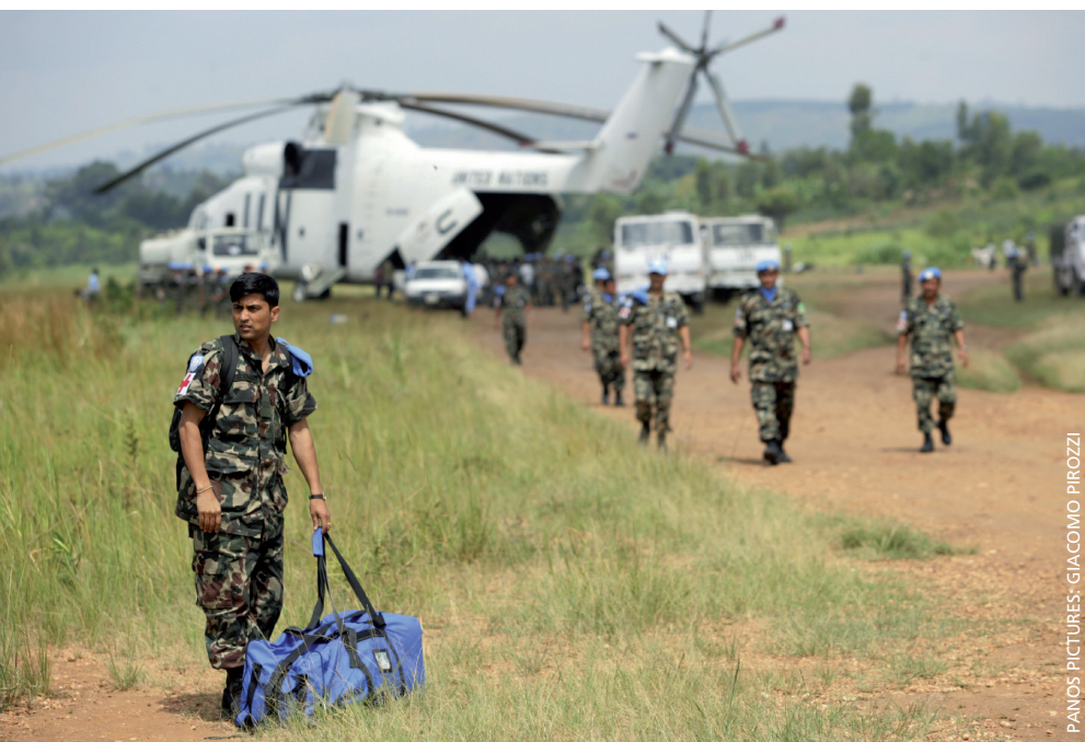
Pakistani UN troops disembarking from a transport helicopter in the Democratic Republic of Congo