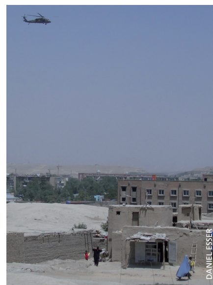
ISAF Helicopter flying over war torn Kabul