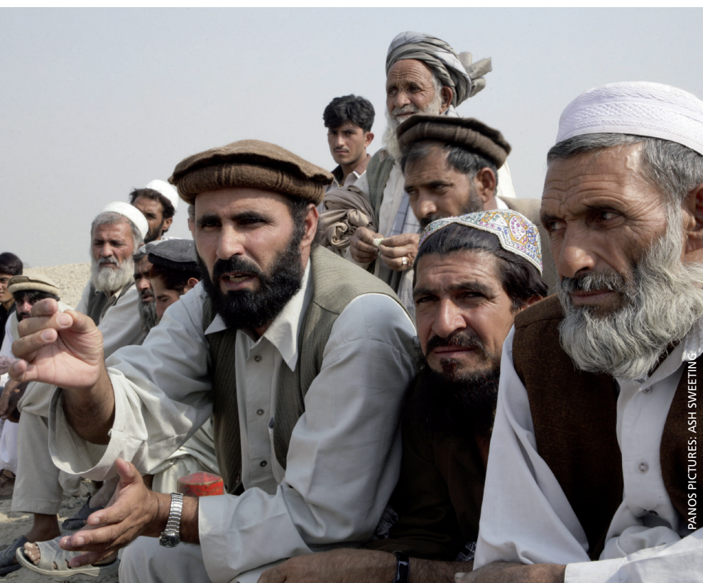
Tribal elders in eastern Afghanistan discussing land allocation at a shura, or gathering of elders

Nevertheless, ensuring basic security from armed challenges by non-state forces remains a crucial first step in any effort to recover from war and build or rebuild social, economic and political life. To date, the failure to make significant progress in building a disciplined national army in the Democratic Republic of Congo has left communities at the mercy of undisciplined soldiers from Kinshasa, the soldiers of the FDLR who were involved in the Rwandan genocide and are still ensconced in the Eastern Congo, and a myriad of armed forces that provide protection for their threatened communities while raiding and looting the villages and towns controlled by their rivals. In Afghanistan, the new national army remains far smaller than envisaged and still dependent on foreign trainers, while an array of militia groups are still relied