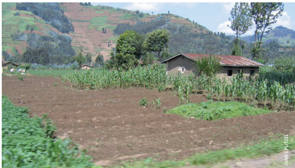
Rwandan agriculture occupies all cultivable land