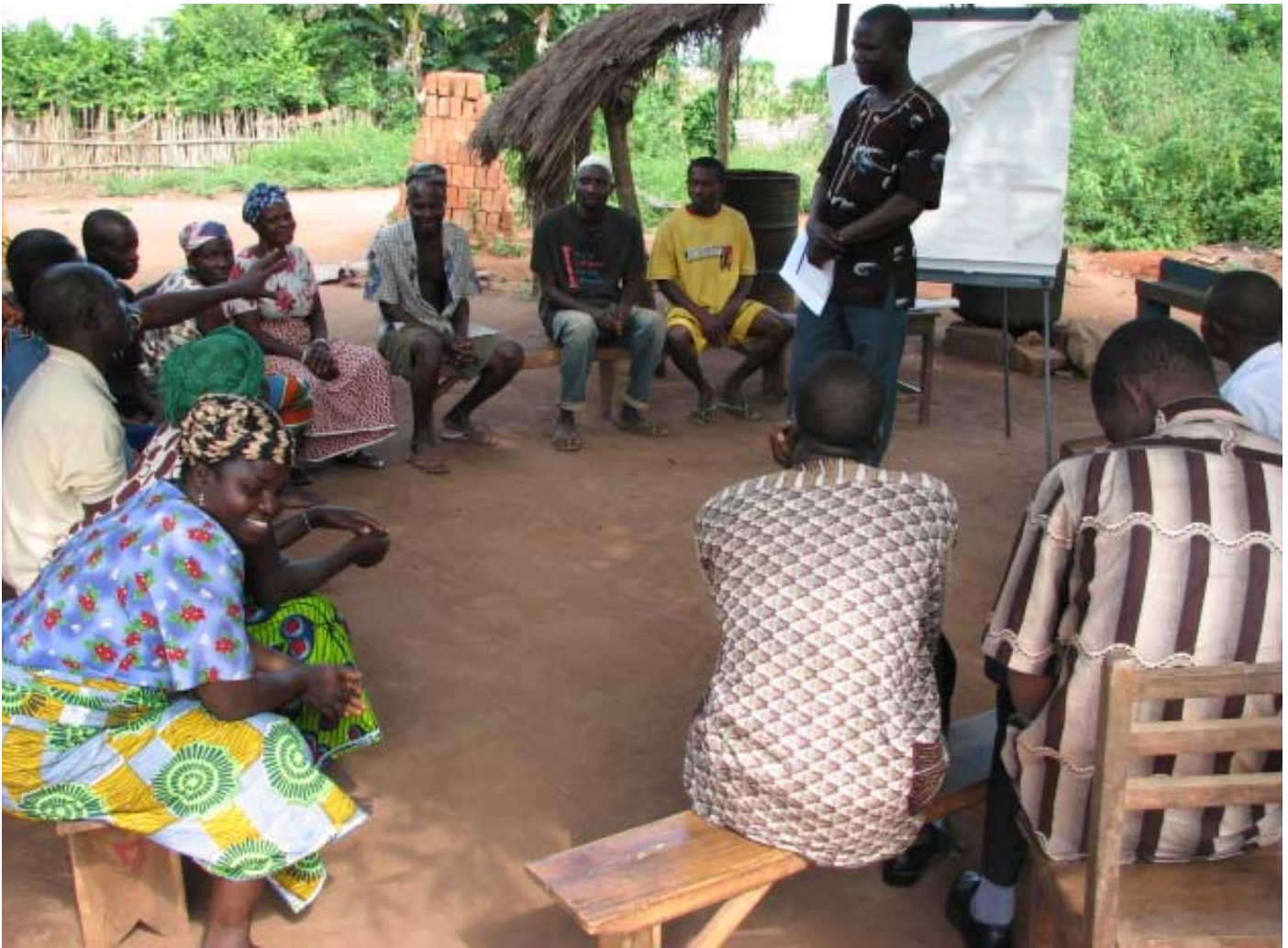
Farmers of Kpomasse (Atlantic) assessing the impact of early warning on agricultural activities in July 2009

Testimonials reveal the following examples of the impacts of capacity building of producers in the use of agro-meteorological information :