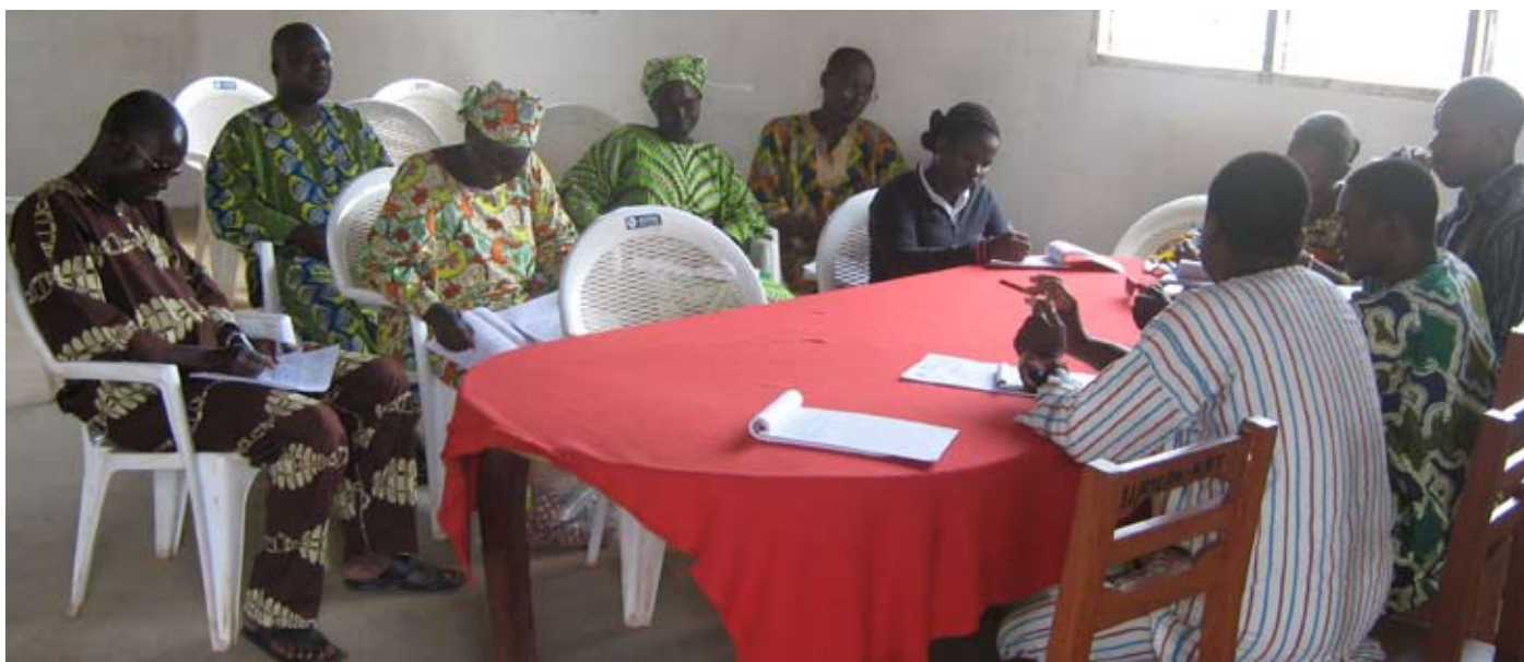
A meeting of the CCPA in Ketou (Plateau) to assess the performance of the early warning system in March 2009