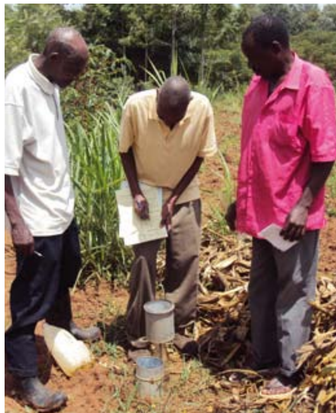
Farmers learn conventional methods of measuring and recording rainfall

Farmers used the exogenous knowledge of climate variability to assess the capability of seasonal forecasts to capture local-level climate variability. Next, for 3 years starting with the short rains of 2007, a team of farmers, extension agents, agricultural researchers and the meteorological service together developed downscaled (locally adapted) climate forecasts from the seasonal climate forecasts issued by KMD. Inputs from local leaders, farmers and extension agents were used in the downscaling process. These inputs included consideration of farmers' own indicators for climate forecasting and determination of how local topographical features differentiate rainfall and thus shape local climate variability. This helped to correct the forecasts and thus enhance their local accuracy. The downscaling process is summarized in Box 1.