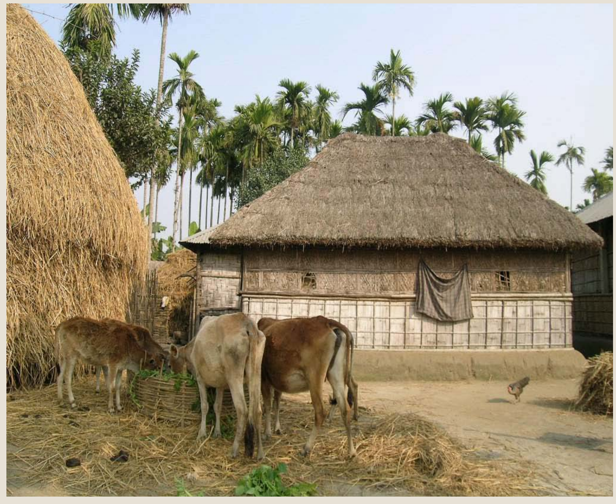
Cows, chicken or goats were given to residents to help them make money.

A programme of transferring income generating assets such as goats, cows or chickens to the extremely poor in Bangladesh improved the income of the beneficiaries. However, the programme run by BRAC, a Bangladeshi non-governmental organisation (NGO), had little effect on children's education, Bangladeshi iiG researchers found. Their research shows that despite the success of the transfer programme in increasing incomes it did not automatically lead to increased school attendance of the recipients' children. They conclude that transfer programmes need to have additional components targeting the education of extremely poor children. Such components might be "conditional cash transfers" which have previously been found to improve enrolment rates.