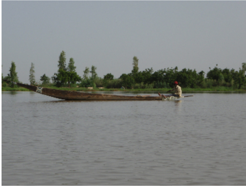
Figure 3. Bozo fisher in the Niger River

However during the dry season, the Niger River dries up in many areas, leaving behind isolated pools in what were the deepest portions of the river. At the end of the décru (the decline of water levels), four of these pools 12 , referred to as “fishing reserves” are closed to all fishing by the Somono water masters in Kouana, Komio and Sensé. This period referred to as a “ mise en défens ” (closure) lasts two to three months, usually between February-April, to allow the remaining fish to grow. Subsequently, the water masters organize collective fishing events (known as a “ yaya ”) in the fishing reserves.