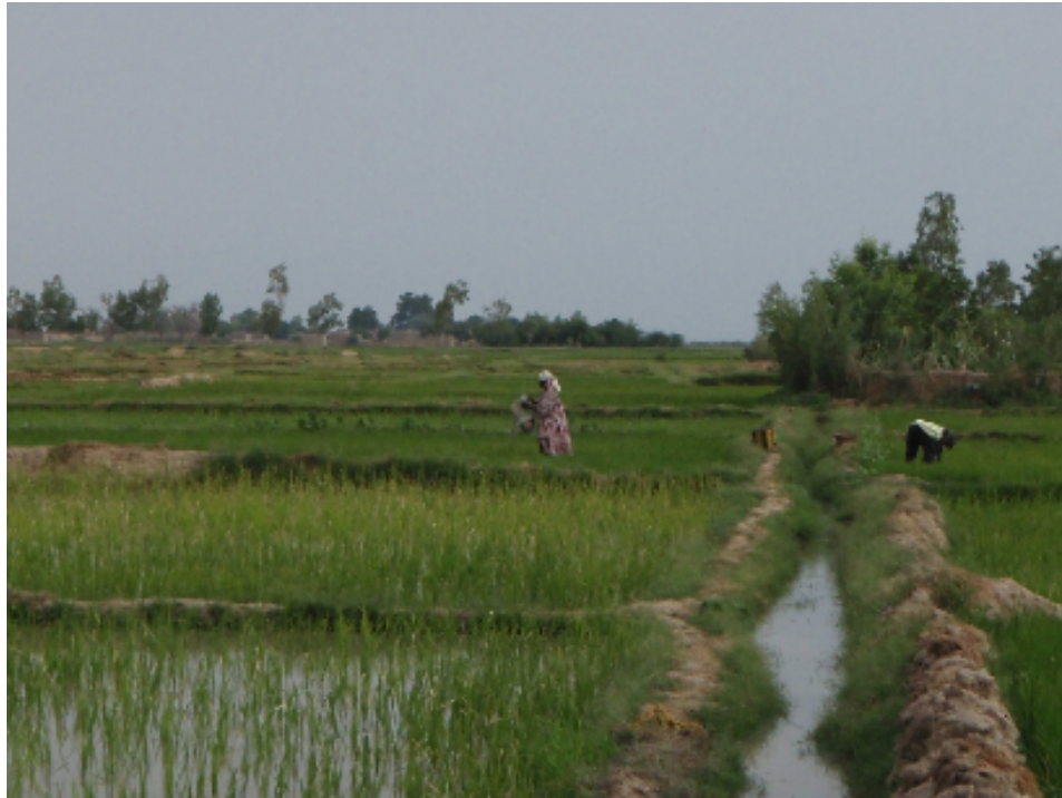
Figure 4. PIV in Komio Village

families to return to their villages. 17 However the chief of Komio and local politicians in charge of the PIV misappropriated the proceeds, causing the neighboring communities to seek establishment of their own PIVs in the early 1990's. For this same reason production in Komio came to an end in 1997 when the pumps broke and were unable to be replaced.