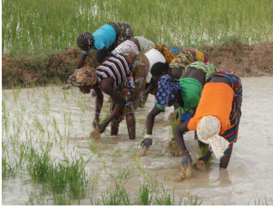
Figure 6. Women collectively transplanting rice in their PIV