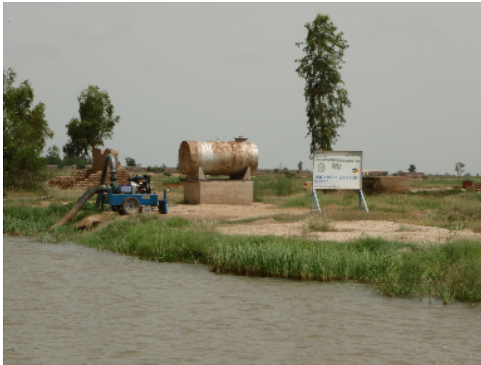
Figure 5. PIV Irrigation pump at Kouana

This village's PIV scheme is limited to one season per year as the arm of the Niger River on which it is located dries up completely during the dry season.