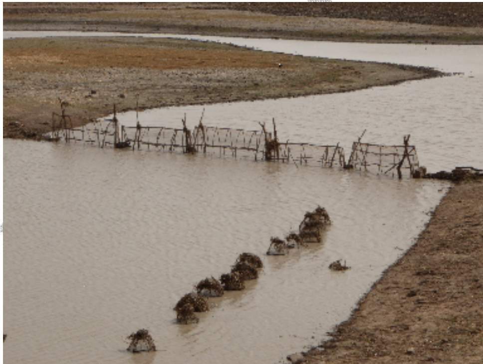
Figure 2. Fishing traps in a mare channel

Ownership of fishing channels is only exercised during the months of November to February, when the declining water levels (a season referred to as the “ décru ”) make the channels strategic fishing locations. The enforcement of private channel fishing rights is a common institution throughout the Inner Niger River Delta, and though it may raise questions regarding equity in ownership of channel fishing rights (Fay 1989), it does not appear to be a source of conflict in Komio. The primary channel fishing method used by the Bozo is based on use fishing traps spanning the entire channel, constructed of fine-meshed gillnet spanned over a wooden frame, with multiple entrances that allow fish to enter but not exit (see Figure 2). Additionally, gillnets may be strung across the channels.