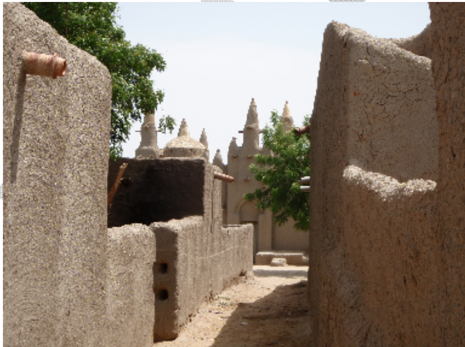
Figure 1. Traditional mud brick mosque in Kamaka village