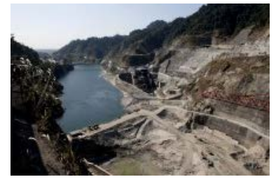
Lower Subansiri dam and power station in Arunachal Pradesh, Northeast India

But many studies have pointed out that these benefits are often outweighed by the disadvantages,