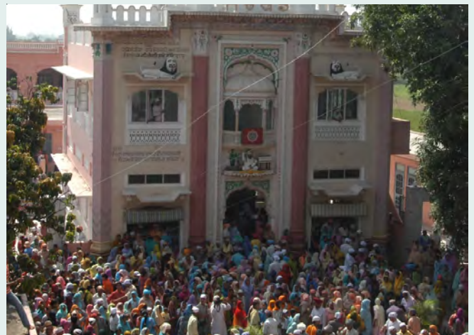
Figure 1: Dera Sant Sarwan Dass Ballan