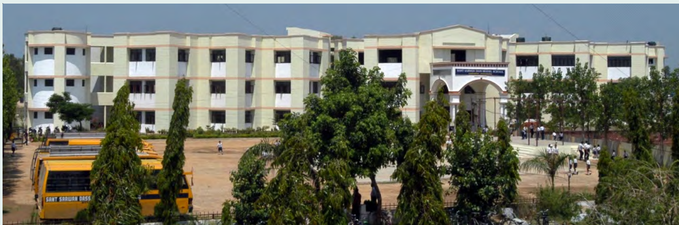
Figure 4: Sant Sarwan Dass Model School, Phagwara