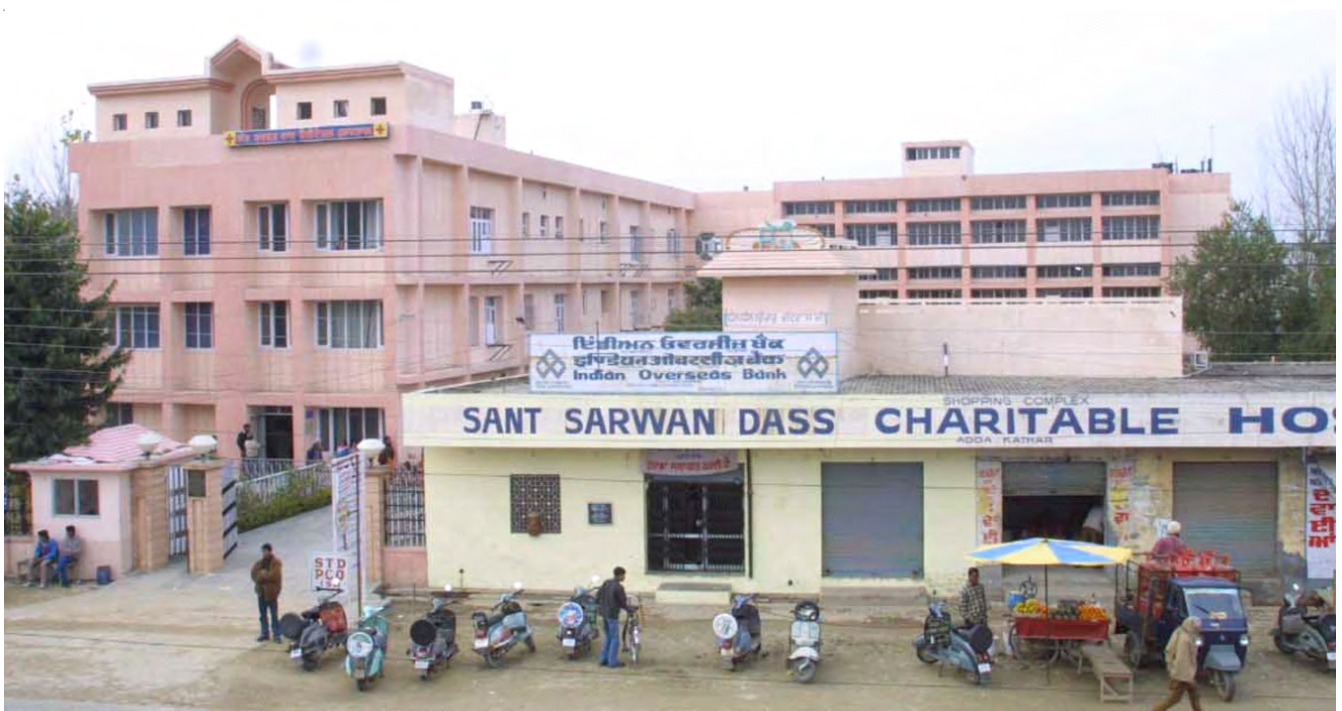
Figure 4: Sant Sarwan Dass Charitable Hospital, Adda Kathar

activities, the DSSDB has invested in education and health facilities in its area of origin. Although these facilities make only a limited contribution to the achievement of development objectives in Punjab as a whole, their significance lies in enhancing the social status of the Ravidassia community.