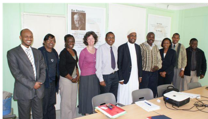
Figure 5. Meeting between PAR, RPA researchers and the Minister for Development of Northern Kenya and other Arid Lands, Nairobi, 2010.