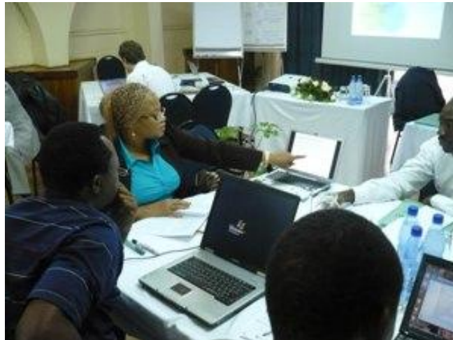
Figure 3. Research review workshop, Lilongwe, April 2010

commenced fieldwork between November and December 2009 after feedback on their research design during and after the workshop. The Malawi team was delayed in this phase due to problems with funds transfer (as reported in earlier technical reports) and logistical and other challenges with their planned case study in Tanzania, which was later abandoned. Phase II finalised with the research review workshop in Lilongwe, 26-28 April 2010 (see Figure 3). The workshop's main focus was to review all draft case study reports, discuss the application of the analytical framework, and develop a broad outline for the engagement strategies.