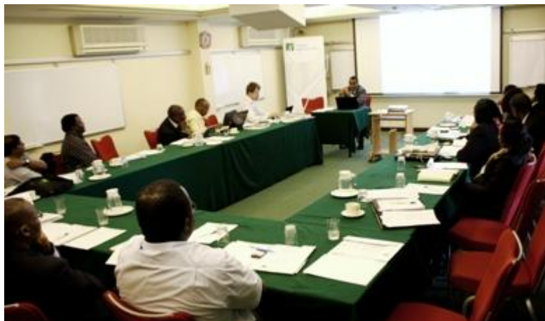
Figure 4. Policy roundtable, Nairobi, 30 September 2010

Policy roundtable on agriculture and climate change, Nairobi, 30 September 2010 (figure 4). The roundtable was organised by KIPPRA, as a joint effort between the RPA project and the Future Agricultures Consortium. The roundtable was attended by policy makers, NGO representatives and researchers involved in work on climate change and agriculture in Kenya. The meeting drew on findings from case studies under the RPA project in Kenya, and represented the launch of the Climate Change Theme of Future Agricultures Consortium (FAC) in Kenya. The meeting explored how the increasing international attention to agriculture and the potential impacts of climate change may play out in a Kenyan context through questions such as: How climate change goals are negotiated in the agricultural sector? And, how can research better engage with and inform national level policies?