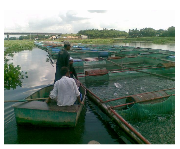
Fig. 2 Cages along the river in Chandpur.

Cage dimensions were basically used the same as in Thailand (6 m X 3 m). Cage frames are made up of 2.54 cm diameter GI pipe. Cage height is maintained 2 m maximum as the Dakatia River is not so deep. The cage frames are arranged in series keeping 45 cm gap between two to accommodate exhausted barrels. The frames are set by connecting rods with clamps in each head. As the river water has multiple use covering inter district riverpath navigation, cages have been arranged in a single row (Fig. 2) either one side or both the sides of the river leaving enough space in the middle of the river for navigation.