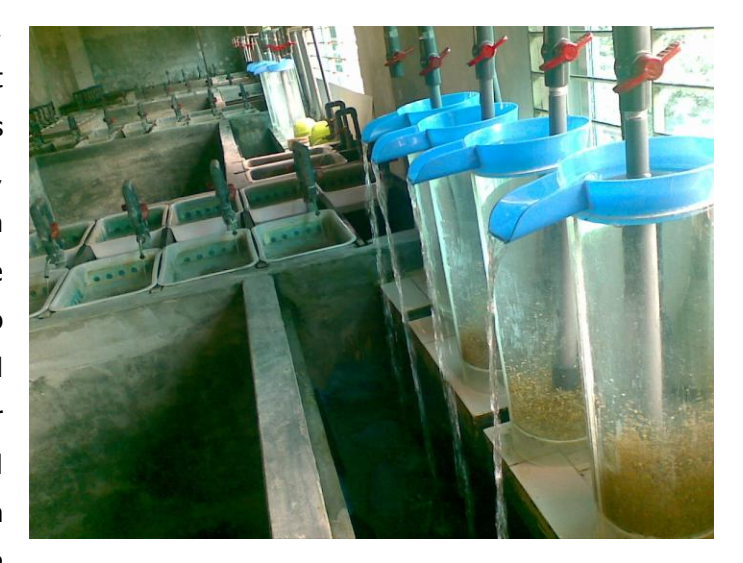
Fig. 1 Pioneer tilapia hatchery

Number of interested cage farmers increased, so the demand for mono-sex fry. As a result it was felt that the single SRT hatchery was not enough to supply adequate fry. In 2006, a Pangus farmer Mr Mosharef Hossain Chowdhury from Chandpur near the cage culture area expressed his interest to establish a tilapia hatchery. Then the second private monosex hatchery named "Pioneer Fisheries & Hatchery" was started at the end of 2006, which started supplying seeds in 2007 (Fig. 1). This hatchery played key role in booming the cage culture through