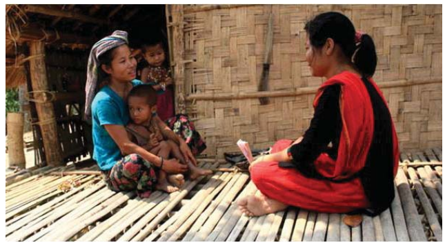
Making markets work for adivasi women in the hills

The hidden hunger is acute among the dependent poor such as elderly, women or child-headed households, disabled and most marginalized population. Their rights are being violated constantly. Most of them are incapable of contributing to the economy, are treated as burdensome, and are unnecessarily being harassed. Our government should have a comprehensive social protection policy to take full responsibility of this population so NGOs can work those who have production potential."