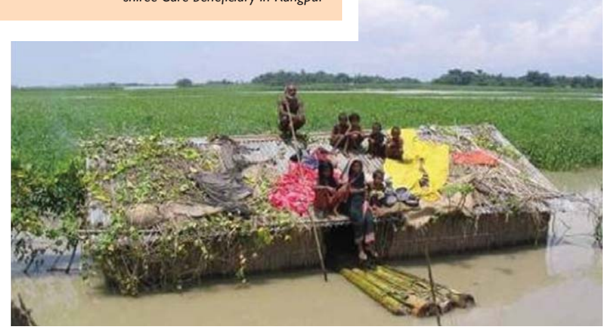
Victims of flood in Gaibandha

Special Correspondent, Bangladesh Shangbad Sangstha