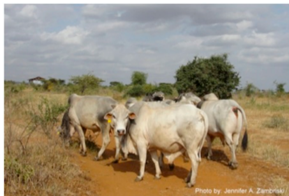
Photo 9. Boran cattle at the Boran Cattle Breeding Center

Another potential opportunity in the region is via collaboration with the Boran Cattle Breeding Center. This center is dedicated to the preservation and improvement of Boran cattle breed, and raises several hundred cattle