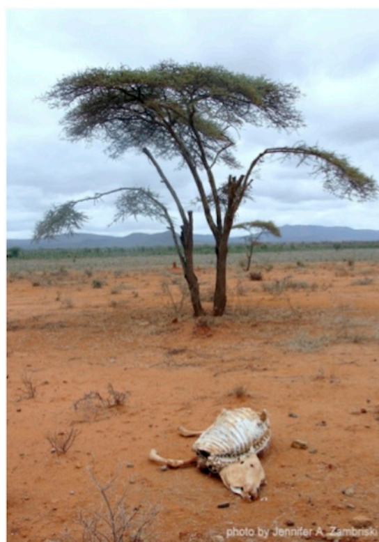
Photo 3. Unconsumed remains near Moyale in August 2011 point towards high livestock mortality during the current drought

Although large herds may represent economic and food security, livestock herd size is also correlated with animal well-being and herd mortality. Larger