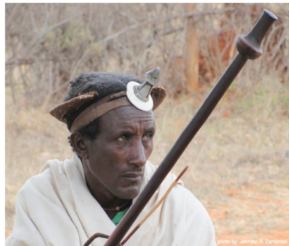
Photo 1. Boran pastoralist, Dirre, July 2011

and objectively verifiable, and cannot be manipulated by either party to the insurance contract. In order for IBLI to be successful in Boran, it must be synergistic with successful coping mechanisms currently in place, as well as risk management modalities under development. It is therefore essential to have a thorough inventory and critical evaluation of