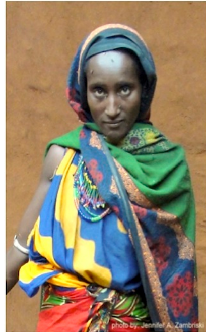
Photo 7. Boran woman, Dillo, July 2011

Therefore, labor is often divided along gender lines. In FGDs, women noted that their responsibilities included: taking care of children, food preparation, medical care for the family, and other activities which involved maintenance of the household. In contrast, typical responsibilities of men include tending to livestock, locating suitable grazing land and water points, and animal health.