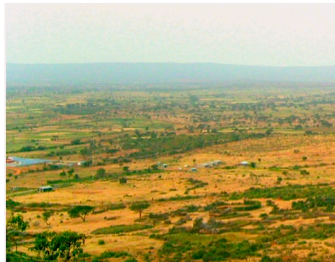
Photo 4. The greener area to the center left marks the edge of the government ranch

There are a number of government and private “ranches” in Borana. The Dida Tuyura government ranch north of Yabelo also houses a breeding center. Some private ranches are run by cooperatives, but there have been reports of more powerful pastoralists controlling these (McCarthy et al., 2003; Temesgen, 2010). Not much was mentioned about ranches