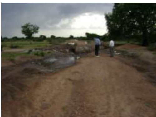
900mm diam culvert laying on Chingongwe – Chipanga road