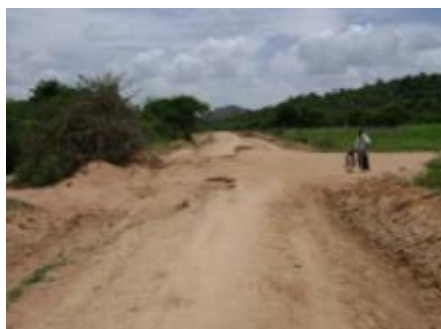
Bihawana – Chididimo road: Location requiring drainage structure (Ch. 3+600)