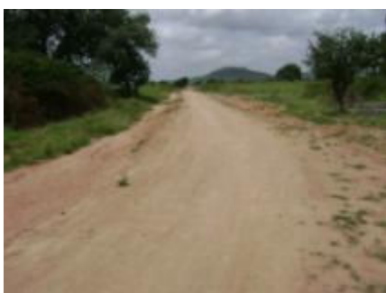
Mbabane – Chizomoche road: Section of road that has been improved and is being maintained

The contractor has been carrying out 'maintenance works' on all roads to some extent and will continue to do so in the coming months to the end of the contract in September 2012. Some maintenance activities that are not being carried out to the required quality and this could be due to low understanding by the contractor's personnel of the maintenance requirements. The MEO has been reminding the Contractor to perform as per the contract.