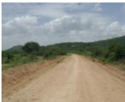
Bihawana – Chididimo road: Section of road that has been improved and will be maintained