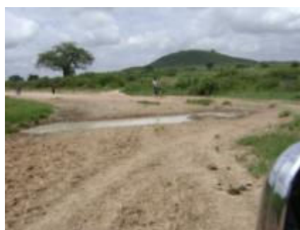
Mbabane – Chizomoche road: Location requiring drainage structure (Ch. 2+100)