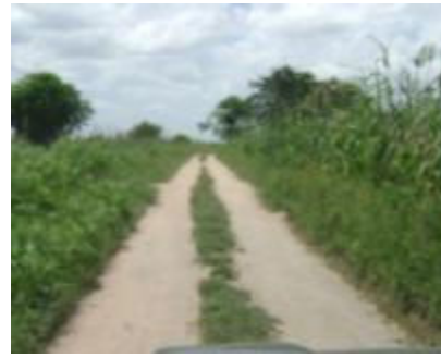
Zuzu – Nala road: Section of road not being maintained properly (vegetation control not done Ch. 3+300)