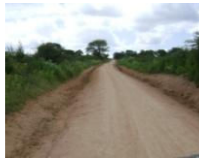
Nala – Veyula road: Sections of road that are being properly maintained (LHS – Ch. 1+500 and RHS - Ch 8+400)