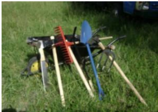
Working tools to be provided to the communities

Preparations for handing over the tools, training the communities and signing of contracts have been done. These activities are now scheduled to take place in early April 2012. Due to the delay experienced in awarding the contracts and the conditions attached to use of Road Funds, the contracts will be for six months.