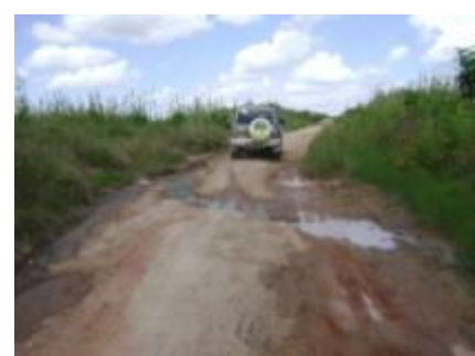
Nala – Veyula road: LHS – un de-silted culvert (Ch.3+600), Centre - vegetation control not done (Ch. 25+200) and RHS – point requiring drainage structure (Ch. 26+600)