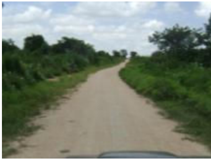
Bihawana – Chididimo road: Section of road not being maintained properly (vegetation control not done Ch. 15+900)