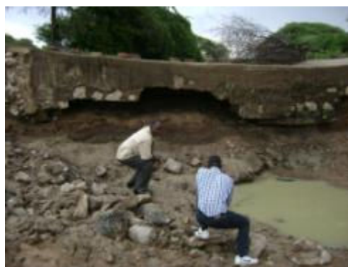
AFCAP Technical Manager sharing views with DE staff on what needs to be done on the