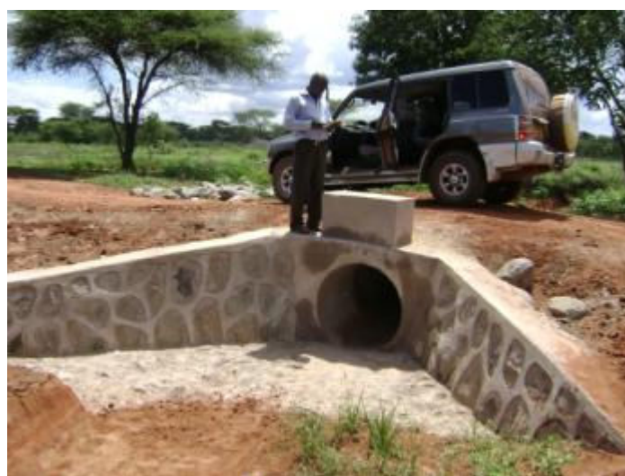
Constructed 900 mm diameter concrete pipe culvert on Babayu- Lamaiti road