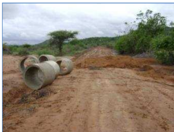
On going works on Mbambala Jctn – Chizomoche and Bihawana – Chididimo roads

A map of Dodoma Municipal Council showing the locations of the roads under PMMR contract is appended as Annex 3