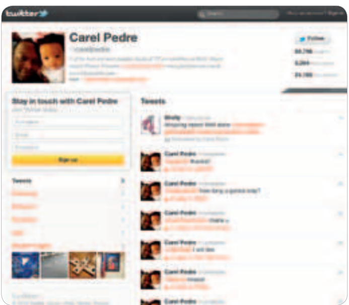
Above Haitian radio DJ Carel Pedre used social media to connect people following the 2010 earthquake, reaching thousands.