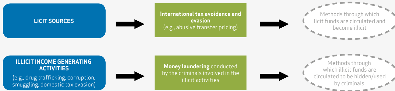
Figure 1: Types of illicit financial flows