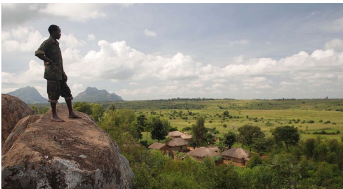
Africa's farmers must be part of the solution for climate change.

Some examples of agricultural NAMAs currently under development are: