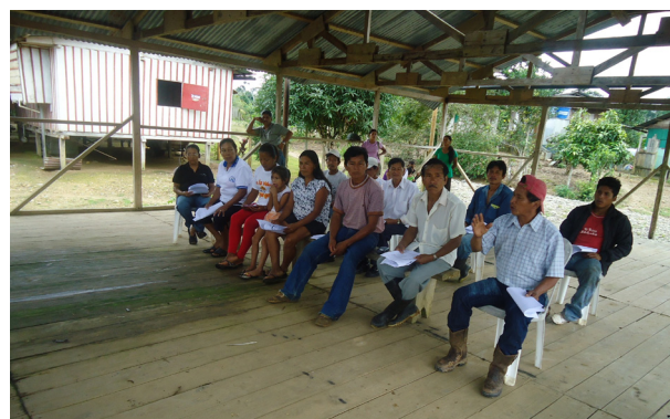
Figure 2: Workshop organised by Grupo FARO explaining to communities how oil income is spent in the Ecuadorian Amazon

Grupo FARO's research introduced this relevant issue into the public agenda at a time when debates were increasing and evidence was needed to design new legislation. This public debate yielded clear results. Later that year, a new constitution was enacted which eliminated ear-marked expenditures for distributing extractive industries' income, one of Grupo FARO's main recommendations. Grupo FARO keeps fighting for achieving greater transparency, accountability and fairness in relation to oil revenue in Ecuador, which is now handled centrally by the government where more transparency is needed. Grupo FARO is currently drafting a bill proposal about the extractive industries information that the government should make public. This proposal will be shared shortly with congressmen and other CSOs in Ecuador. 2