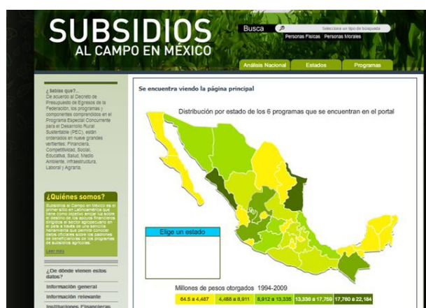
Figure 1: Farm Subsidies Website displaying an interactive map of farm subsidies by province in Mexico

agency in charge of budget oversight, forced the government officials who benefited from the subsidies to return them. The database and its findings have also been used extensively by the academic community and CSOs. In sum, the Farm Subsidies platform, made possible through CSO requests for, and use of, public information, has been a powerful tool for enriching the public debate on the distribution of agricultural subsidies and for improving accountability. 1