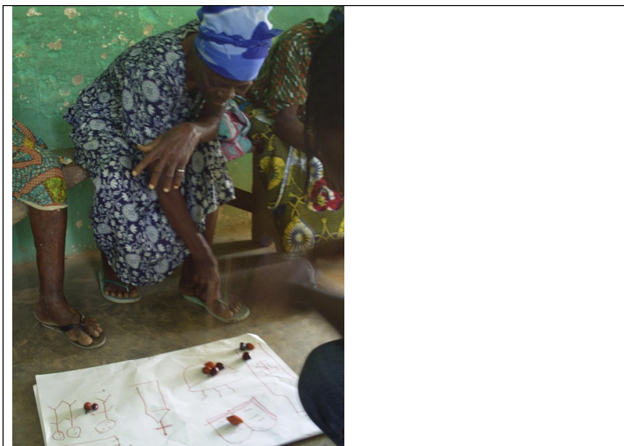
Figure A.3 Individual analysis of household expenditure by a female beneficiary, Agona Abrim community, Central Region, Ghana

Step 7. Once the individual analysis has been completed, ask some follow up questions to the whole group to encourage further analytical discussions around the four research themes: