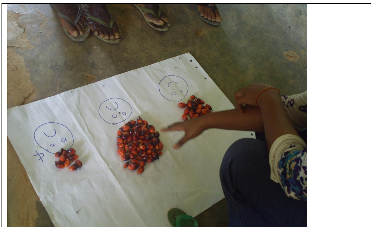
Figure A.1 Introducing 3 well being categories and encouraging an initial allocation of seeds, Agona Abrim community, Central Region, Ghana

Step 2. Ask the analysts to list the characteristics of the beneficiary group (sad face with currency sign). Probe and seek clarification and group consensus. Make careful notes. Note any controversial characteristics that the group cannot agree on. Only prompt on unmentioned issues (e.g. access to land, access to credit) once the group has completed its listing.