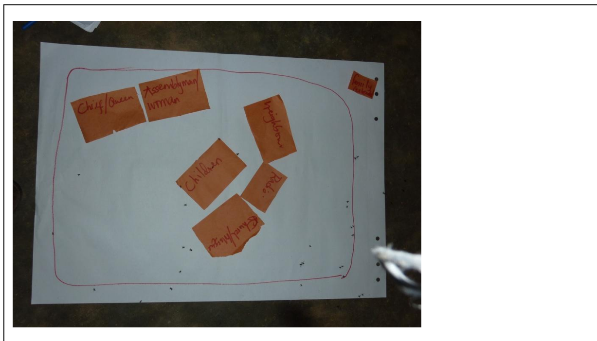
Figure A.4 Venn diagramming with female beneficiaries, Agona Abrim community, Central Region, Ghana

Step 2. Next, introduce cards (rectangular or circular) in three sizes (small, medium and large) and ask the analysts to write the name of each 'actor' on a card, with the size of the card relating to the relative importance of that actor in their lives (i.e. large cards are most important and small cards least important). Ensure that everyone participates in the discussion regarding the size of circle. Note also the basis for the analysts determining the relative importance.