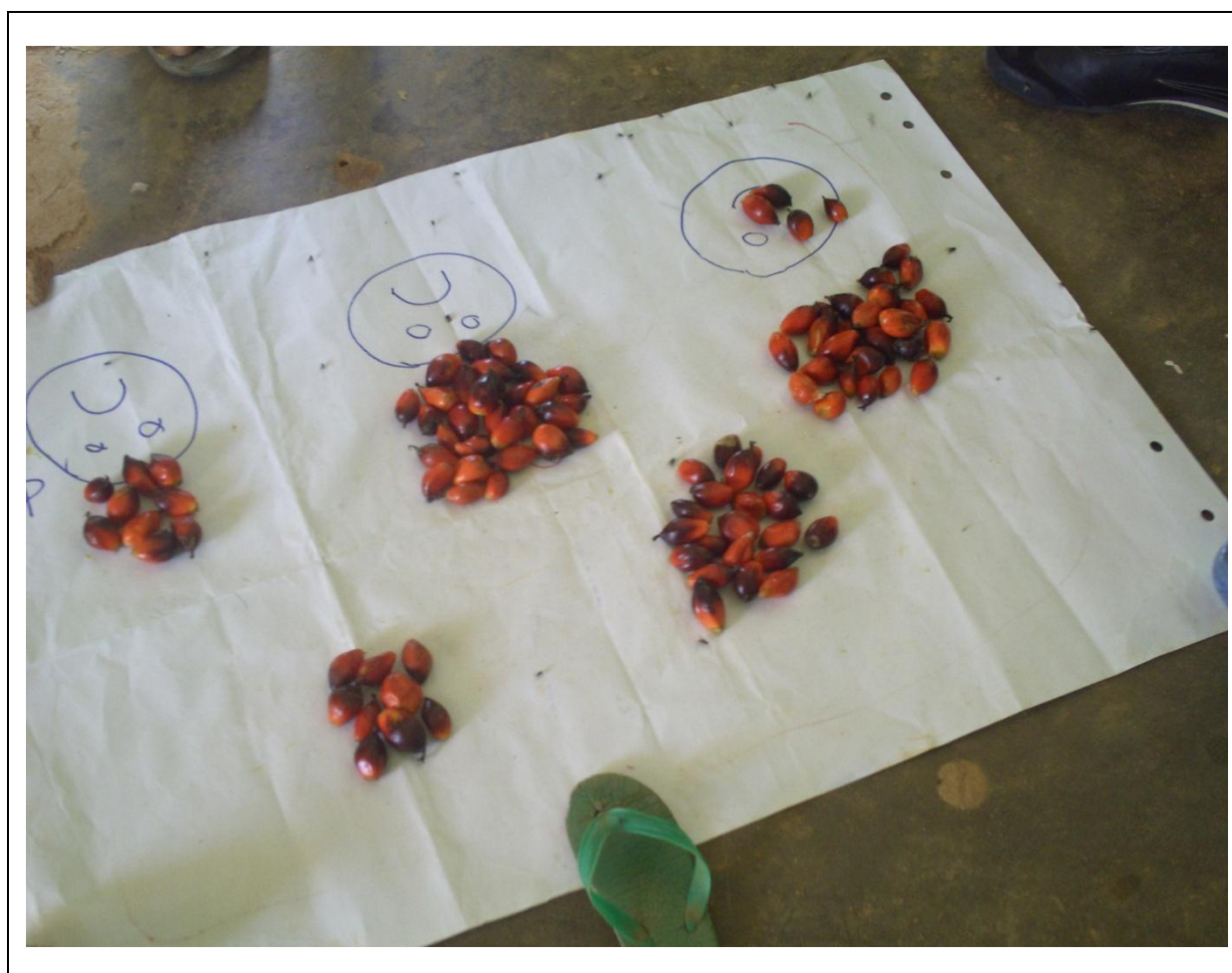
Figure A.2 Group analysis of well-being categories and seed allocation, Agona Abrim community, Central Region, Ghana

You can later convert your notes into a community wellbeing analysis matrix (see Table A.1 and Table A.2 for examples), with allocated seeds listed as percentages in the second column.