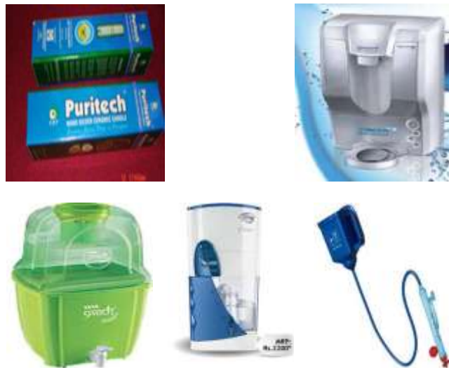
Figure 1: Various nano based products in the market. Puritech Nanocoated Candle (top left), Aquaguard Total (top right), TATA Swatch (bottom left), Purit classic (bottom centre), Lifestraw, Westerguard (bottom right)

For more information refer to annexure 1