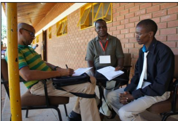
Discussions with a teacher at Matebele Primary School