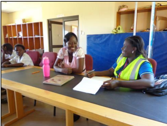
An interview with a teacher at Oodi Primary School