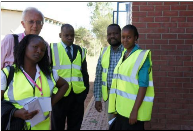
Traffic and road safety data collection at Matebele: some members of the research team