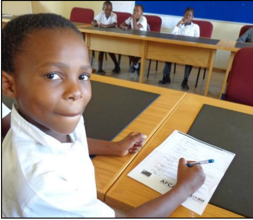
A pupil taking a road safety knowledge test at Oodi Primary School