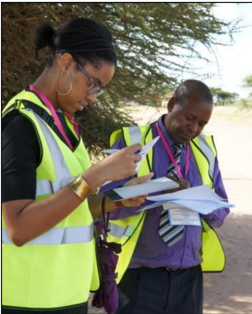
Collecting road traffic data at Matebele