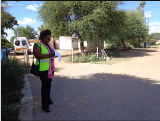
A traffic and pedestrian count being carried out outside the chief's office in Oodi