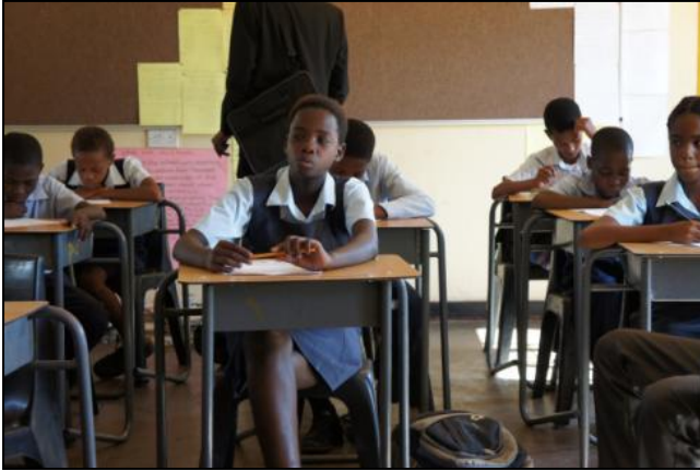
Pupils sit the road safety knowledge test at Matebele Primary School