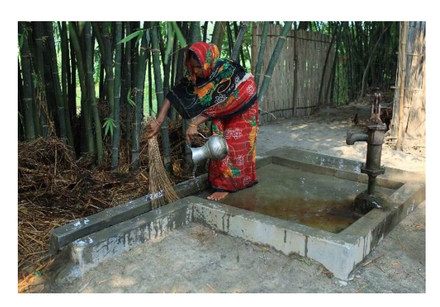
Access to water, one of CLP's ten graduation criteria

In terms of the access to improved water criteria, it should also be pointed out that at the start of CLP 2 not all core participant households were targeted to receive an improved water supply. This policy changed in 2012. CLP's Infrastructure Unit initiated a 'resweep' meaning households that had left the CLP would be re-visited and provided with access to water. All CPHHs will now gain access to an improved water source.