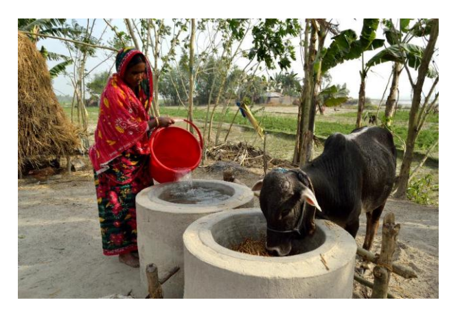
A CLP participant on course to graduate

The Chars Livelihoods Programme (CLP) aims to provide 78,000 extreme poor core participant households (CPHHs) with an integrated package of support lasting 18 months. Because not all CPHHs can be supported at the same time, six groups (called cohorts) therefore receive the package through cohorts averaging 13,000 CPHHs.