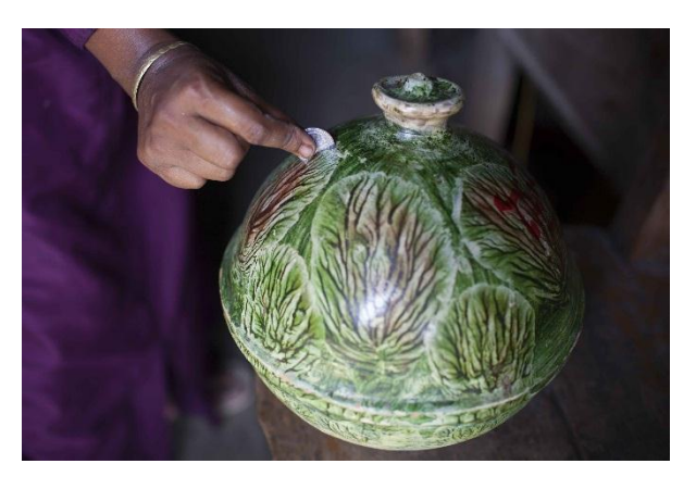
Cash savings, one of CLP's ten graduation criteria

Data was collected from a sample of households for each of the four cohorts, 2.1 to 2.4. For cohorts 2.2 to 2.4 data was collected during the 18th month of support. For cohort 2.1 data was analysed from two surveys (six months before the end of support and 10 months after the end of support – depending on indicator). This is because when Cohort 2.1 support concluded the current graduation criteria had not been agreed and the M&E system had therefore not been developed to efficiently capture the information.