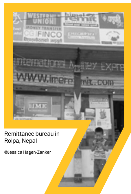
Remittance bureau in Rolpa, Nepal